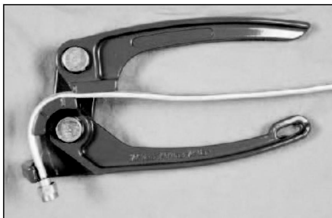
Figure 6 — Bending semirigid cable with a miniature tubing bender.

the center conductor of the semirigid cable as the connector center pin, and make the end of the copper outer tube flush with the mating surface of the connector outer conductor. So the first operation is to cut the outer tube clean and square at the desired length, leaving about a ½ inch beyond the cut. I use a miniature tubing cutter to score the outer tube, as shown in Figure 2. The precision model at my local hardware store or from www.smallparts.com works really well — just a couple of times around scores the thin tube enough to snap the line with my thumb, as shown in Figure 3. The unwanted end of the tube can be wiggled off.