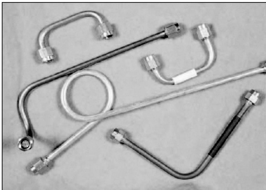
Figure 1 — Surplus semirigid cable assemblies come in all shapes and sizes.

Surplus cable assemblies only come in two lengths: too long and too short. And they are usually pre-bent, in the wrong place. Often, we choose to make do, adding additional bends and tolerating extra length and loss. But sometimes we don't have the space or can't tolerate the extra loss, and