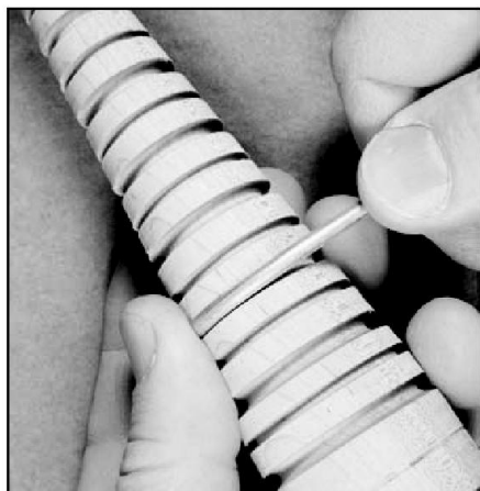
Figure 5 — Bending semirigid cable around a homemade bending jig.