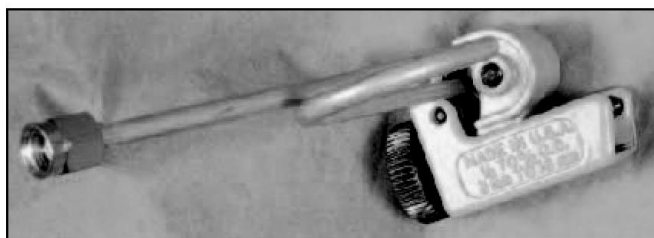
Figure 2 — Score the outer tubing with a miniature tubing cutter.