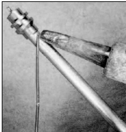
Figure 4 — Solder the connector body to the cable. Make sure to slide any necessary pieces on the cable first.