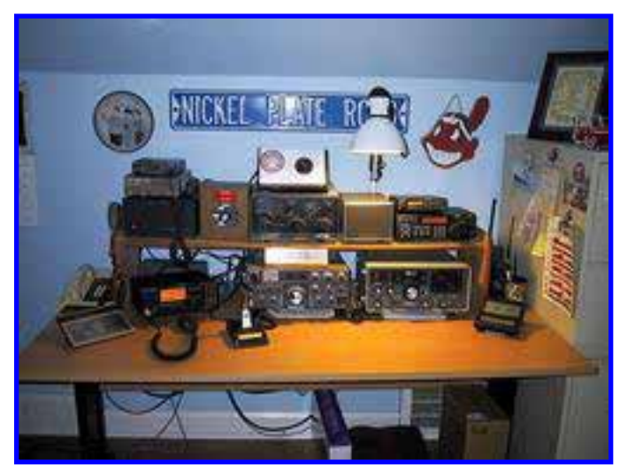
A picture of the shack before I removed the mikes! Operate CW, PSK31 and RTTY.

This was my first SKN ever in 22 years of being licensed. I made a total of 5 contacts on 80 and 40 meters (and one on 15). This was a real enjoyable event and it was good to hear so many hams participating and all the vintage equipment. I used by back up rig, a Kenwood TS530S and my Nye-Viking straight key.