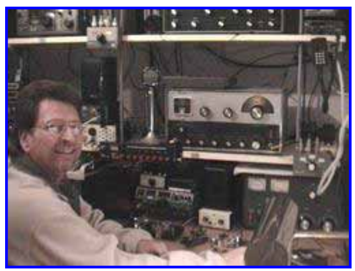
N2JPR - Straight Key Night 2003

I made my first contact with W1WAI on 80 meters. Dave had a nice signal for a homebrew 5W rig. I was using the Knight R-100A receiver, the T-150A transmitter (shown in the picture) and a J-38 key with 100 watts to my windom. We had a nice exchange and I listened to the many great QSOs going on at that time.