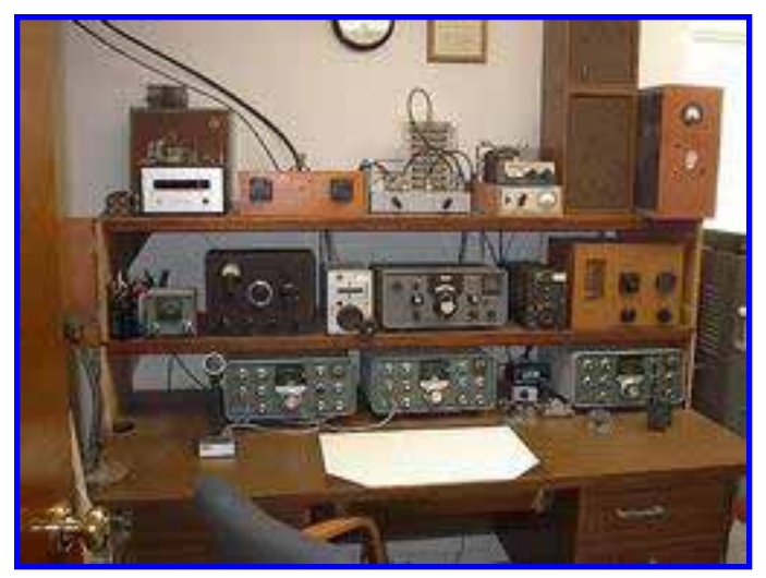
The primary CW rig is homebrew parallel 1625's with command set VFO and Collins 51S-1.