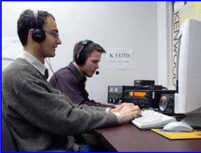
K5AEA Hard at it Saturday evening, with DK1CM helping to pull them out of the noise.