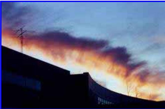
K5UTD's TH-11DX and 40M Rotary Dipole at 100ft flying high in front of a beautiful November sunset.