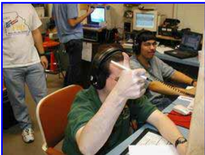
N8YXR gets yet another mult while chasing the sweep