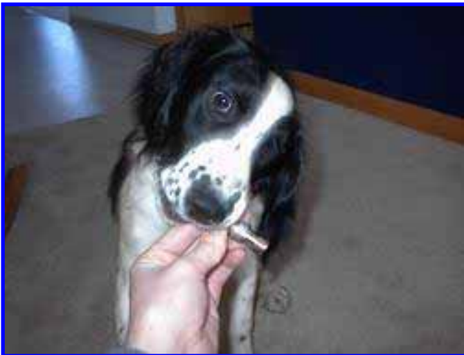
The criminal - Emma

Had a good day Saturday, getting most of the mults out of the way on a 100% S&P effort. Sometime Saturday night, my amp started arcing on all bands -- and i ended up turning it off and running the rest of the contest at 100w. It became harder and harder to work those stations - even close ones. KA9FOX up in WI thought i was QRP for crying out loud. Sunday morning came and my wife had compelling reasons for me to do chores and yardwork rather than "play radio" as she calls it. I spent a few hours in the garage working on various things and even got suckered into putting up xmas lights on the front of the house. Finally It was about 5pm and i was "free" to get back to radio. I figured i could at least pull a sweep, even if i didn't make the # of Q's i had hoped. Well, thats when my wife thought it would be a good time to tell me that our dog Emma had decided to attack my coax that feeds my vertical out back. The coax is about 50 feet of direct-burial coax with the last foot above ground -- also including a rf choke