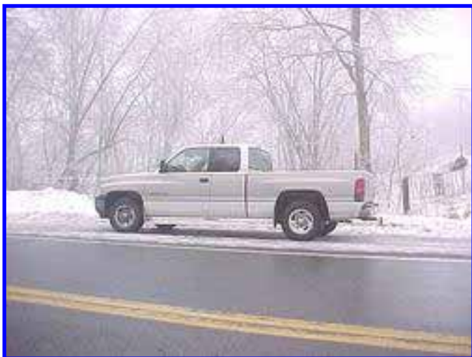
100 A N5SMQ 91 VA ????? Not LA ???? Yes VA it don't snow like this in LA .