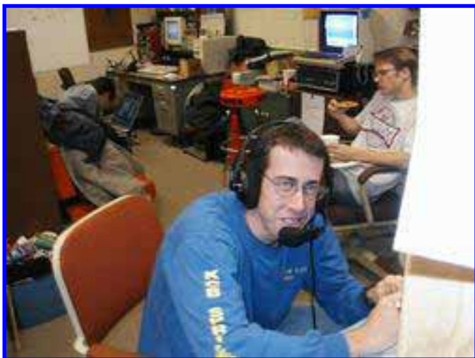
N4LO chases sections while KI0PX chows down