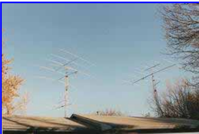
ANTENNAS @ KT0R