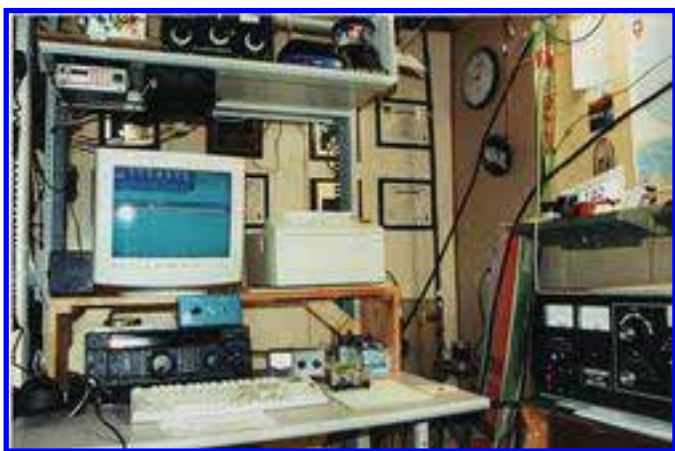
Operating position B KT0R SS SSB 2002