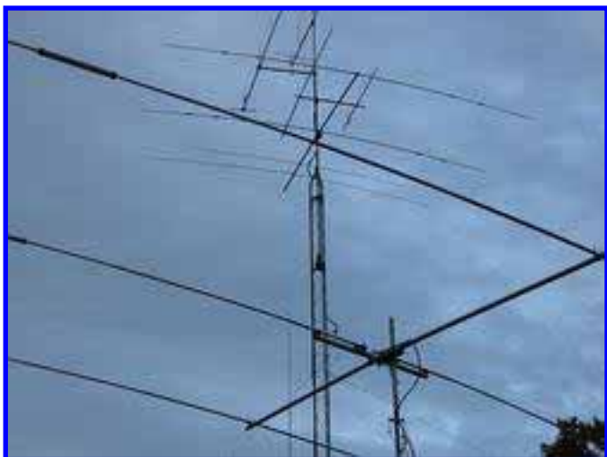
My array, pointed north the whole time! Oooooops!

ray...." I HAD THE SWEEP! With it under my belt for the first time, I was excited. On later inspection, however, it would turn out that I forgot to put the break on and the beam was pointed north the whole time! I can't wait for next year! -- KB1FWN