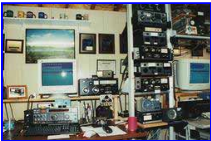
Operating position A KT0R SS SSB 2002