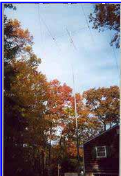
2 el. Shorty Fourty, Tribander and 80m loop hidden in the trees.