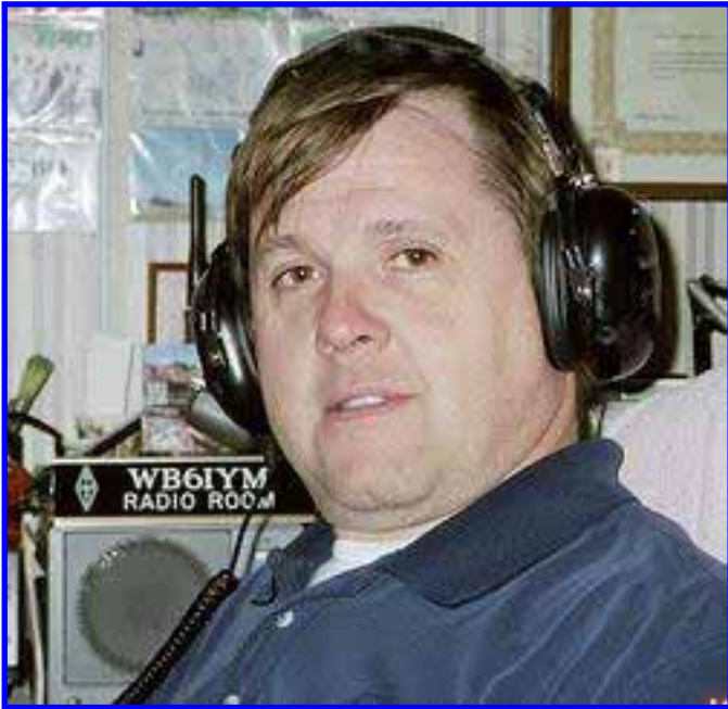
The head Op looking alert, as usual!