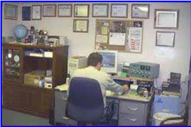
K0FJ's new shack -- IC756 PRO SB-220 TH6 and wires on a city lot

In lieu of a complicated outside 220VAC run, K0FJ routed it from the old shack's closet up through the ceiling and over to the new shack. Turned out to be good aerobic exercise.