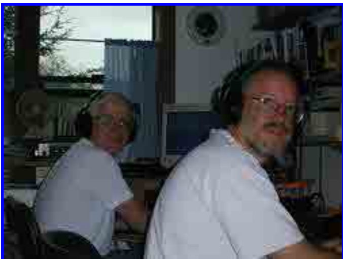
WA0RJY and N0AX are hard at work pulling teeth, er, signals out of the aether.