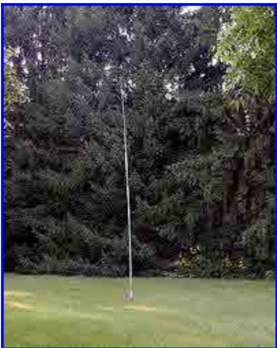
40M to 10M Vertical Antenna At N3NR