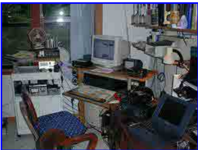
The Mighty K7ED Paladin Contest Club Array of Hardware!

meter alive and we figured it was bad for everybody, so just go! This simplified the use of the second radio greatly. "Is 15 still dead?" "Yeah" "OK, you want to call CQ for a while?" "No, go ahead."