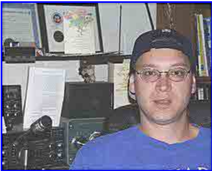
the "weee" hours