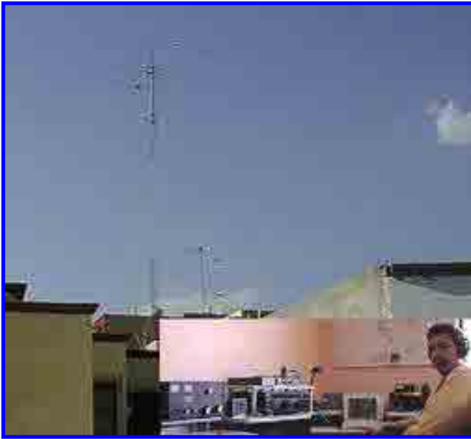
80 Ft Tower and Shack

No SO2R this time due to one of my Band decoders went QRT before the test (Operator's error not Dunestar).