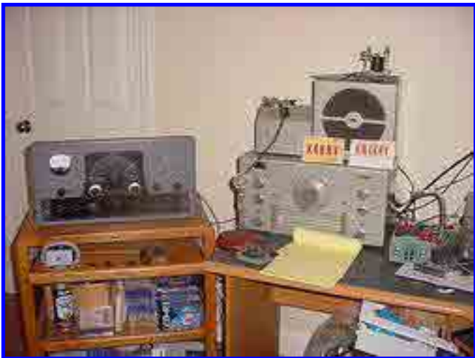
Old ventage station, Good on CW and AM