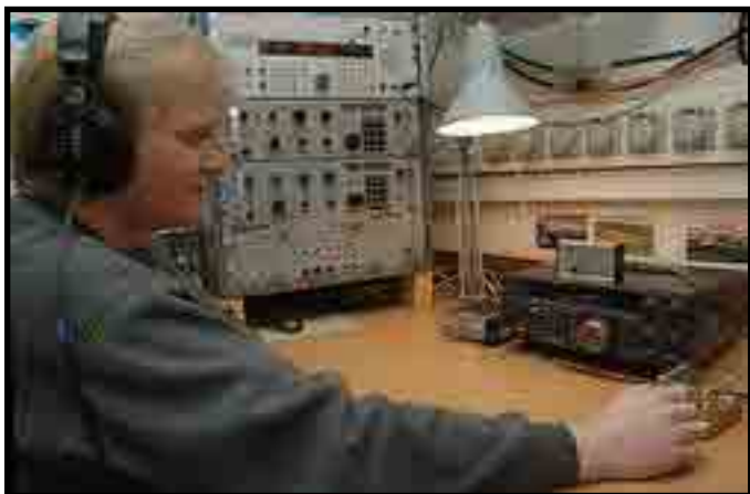
DP1POL (DL5XL) at the operating position.

DP1POL is located at Neumayer Station, Antarctica, Grid Locator IB59VI. I have been working here as a radio operator since December 2002, and will leave at the end of January 2004. I have had a great time in the Antarctic, it was fun to be active on the amateur bands as DP1POL. The "DP" prefix has been issued by the German authorities exclusively for use in extraterritorial locations such as German stations in Antarctica or the South Shetland Islands. I hope that my log will not be mistakenly scored for Germany as it happened in last year's ARRL CW Contest.