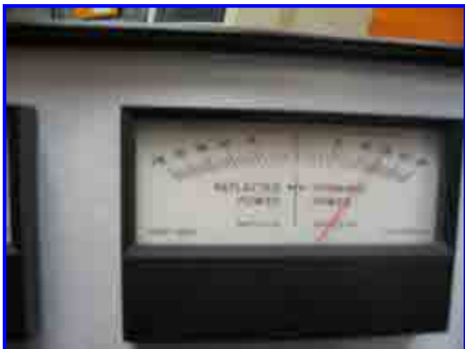
The Henry 4K amp wattmeter at a hair under 1500 watts output.