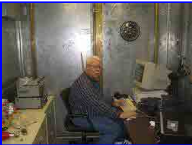
K0BX at the IC-756 and AL-82 Station