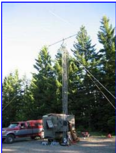
20 meter phone hut