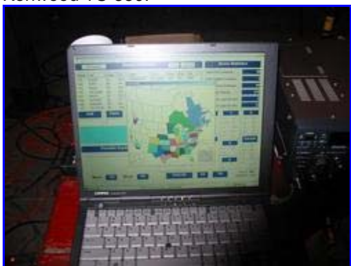
At 12:30 Sunday morning we were racking