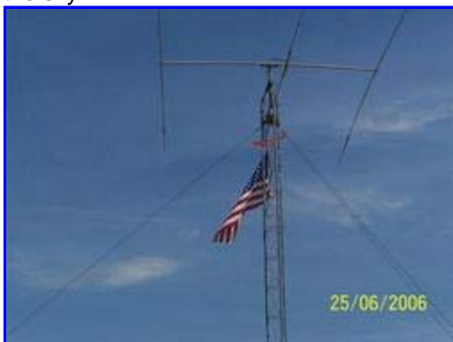
SSB Tower & tribander