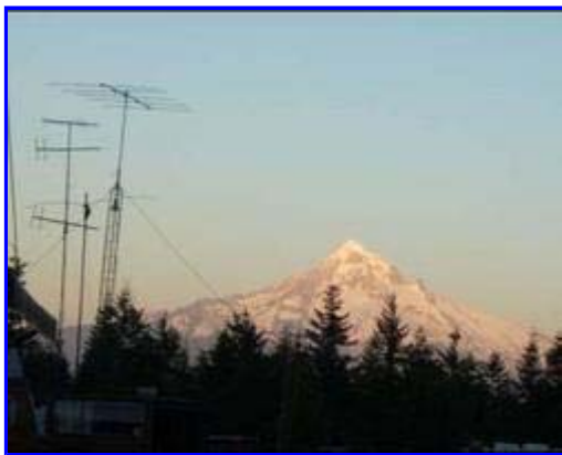
Mount Hood off to the East of the site