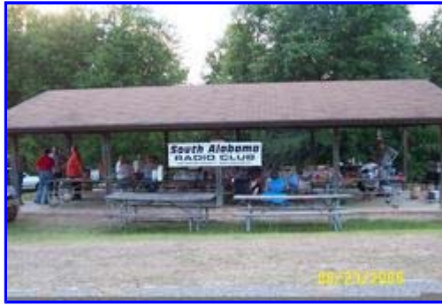
WC4M FD 2006 - Frank Jackson State Park - Opp, Alabama