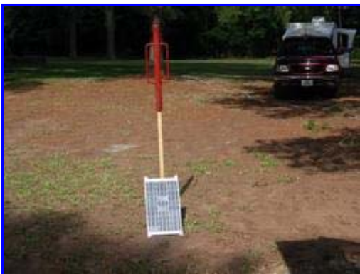
Our solar panel