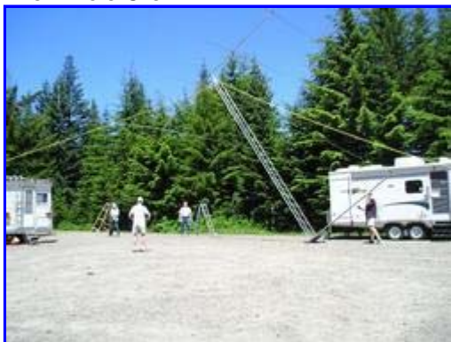
Tower going up with new portable tilting base

WB7QIW, Hoodview Amateur Radio Club, Gresham, OR www.wb7qiw.org -- N7QR