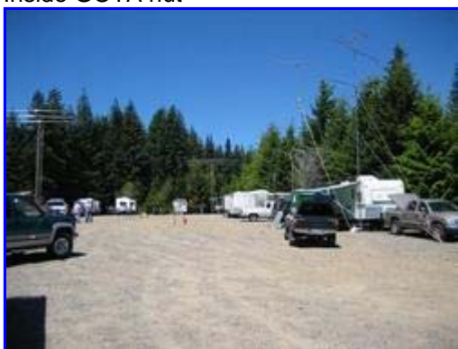
West view of site