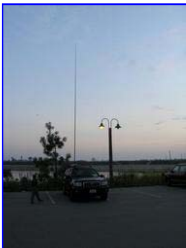
Late in the game, but fortunately my XYL came to the rescue with a camera - this shot is at the Fiesta Island location.