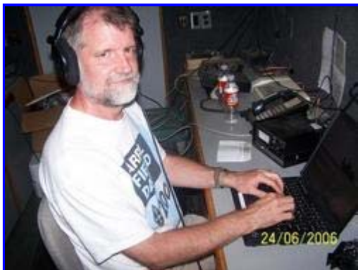
N5NA cranking out the CW qso's