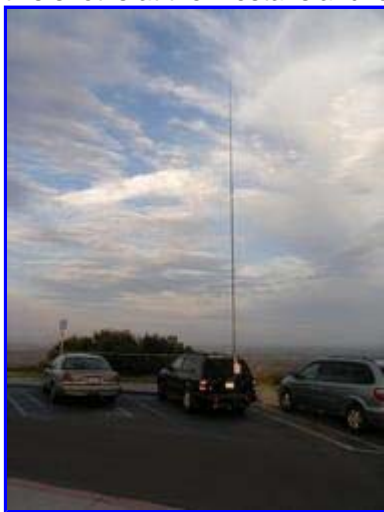
Looking to the East from Mt. Soledad, in La Jolla, Ca. It just doesn't get much nicer than this !

I have always wanted to share the experience of Field Day and Ham Radio to a group of excited Cub Scouts ... well, since BOTH of my Sons are in Cub Scouts, and Dad has the Ham Radio Gear .. and it's the graduation / promotion weekend for the local Cub and Webelo Pack.. Heck, you can't make up a planetary alignment any better than that !!!