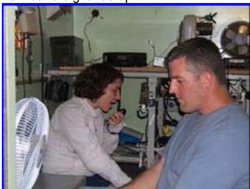
Inside GOTA hut