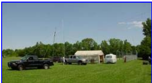
The camp all set up. The antennas in it vary from dipoles to a 2M vertical to an 80M loop