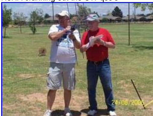
KK5MV and N5OVH working the birds in the sky