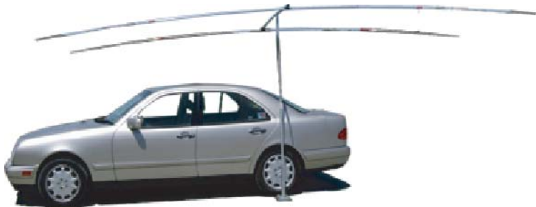
5.5-21' Collapsible Mast

3.5-4mhz with optional coil (only with MP-1)