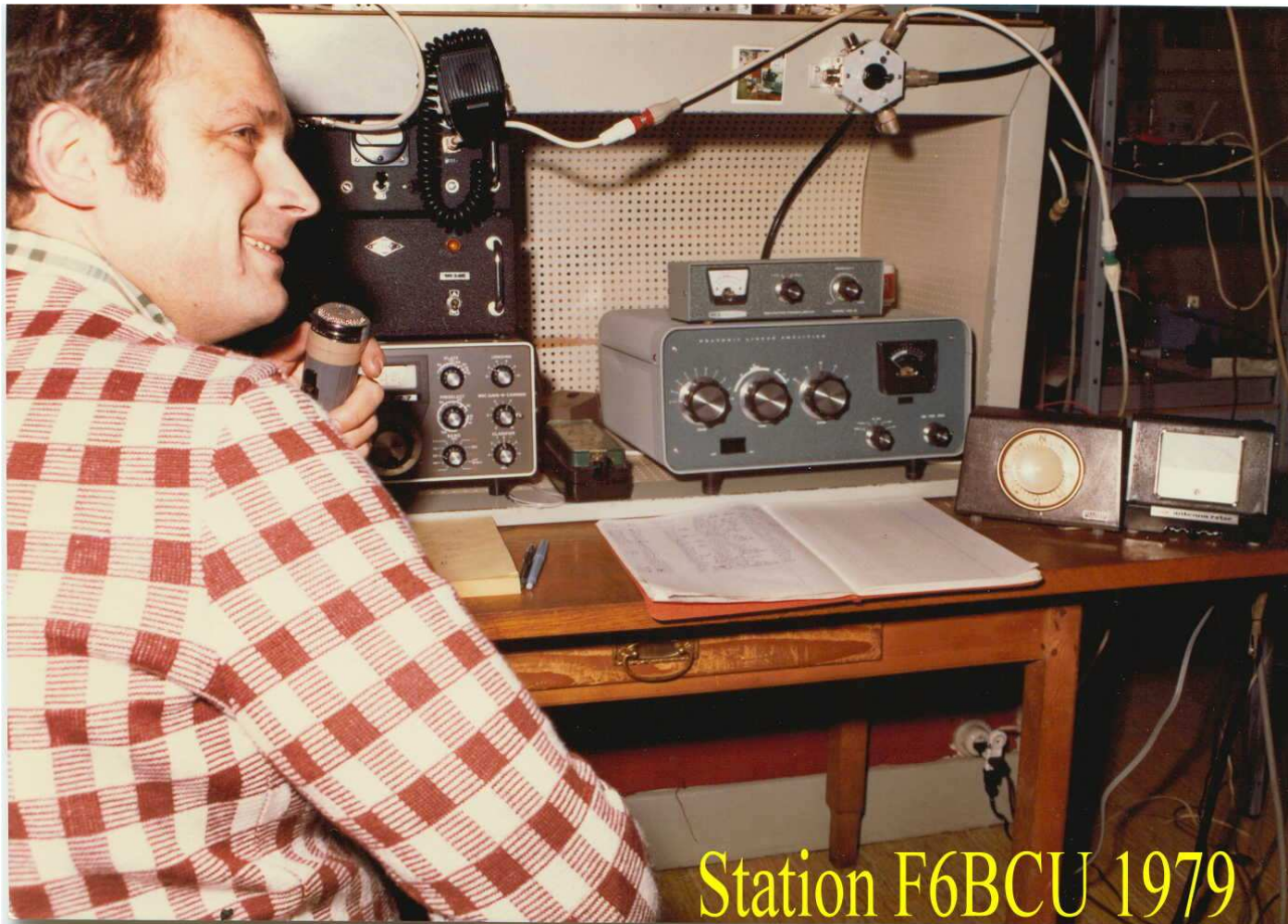
Station F6BCU 1979