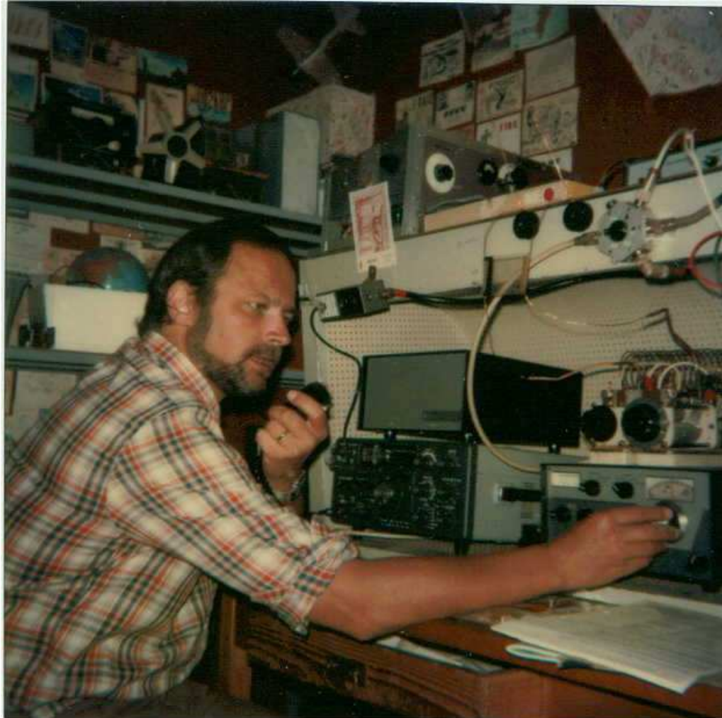
Station F6BCU 1985