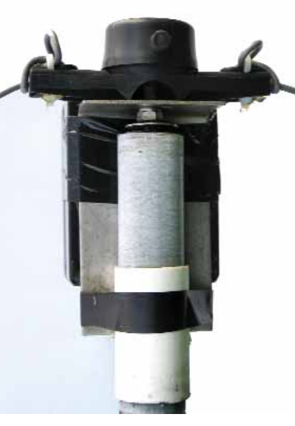
PHOTO 3: Close-up of the rotating dipole centre (balun box to the rear).

mainly as the 'DC injector' that resides in the shack, you will need something very similar as a 'DC extractor' at the remote end of the coax. The circuit diagram is exactly the same as Figure 1 (or maybe its mirror image). However, it isn't always necessary to build two mechanically identical units, For example, if you want to convert an existing remote switchbox, you can often cut a track on the PC board to insert the 3x10nF disc ceramics in the RF pathway behind the input socket and then solder RFC1 directly onto the rear of the socket. The other end of RFC1 is connected to C2, which in turn is soldered to a convenient spot on the PC ground plane - and there's your DC, extracted from the coax and delivered inside the switchbox. Exactly the same can be done for receiver preamplifiers, both at VHF/UHF and for LF receiving antennas such as Beverages and small loops that may also need a remote preamp.